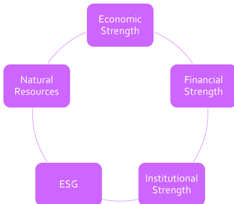
Figure 1: The five pillars in SAR's sovereign credit rating methodology include: